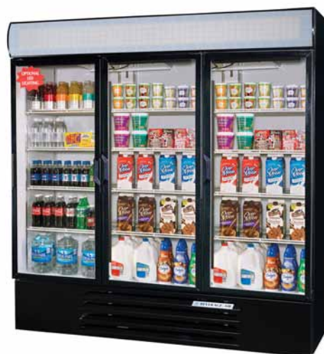
LV72Y (shown with 4 shelves per section)