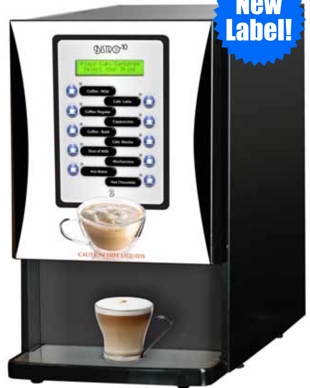
Bistro 10 PN: 123000-BPC

Burgandy Style Still Available just ask for the machine with PN: 400521 front label.