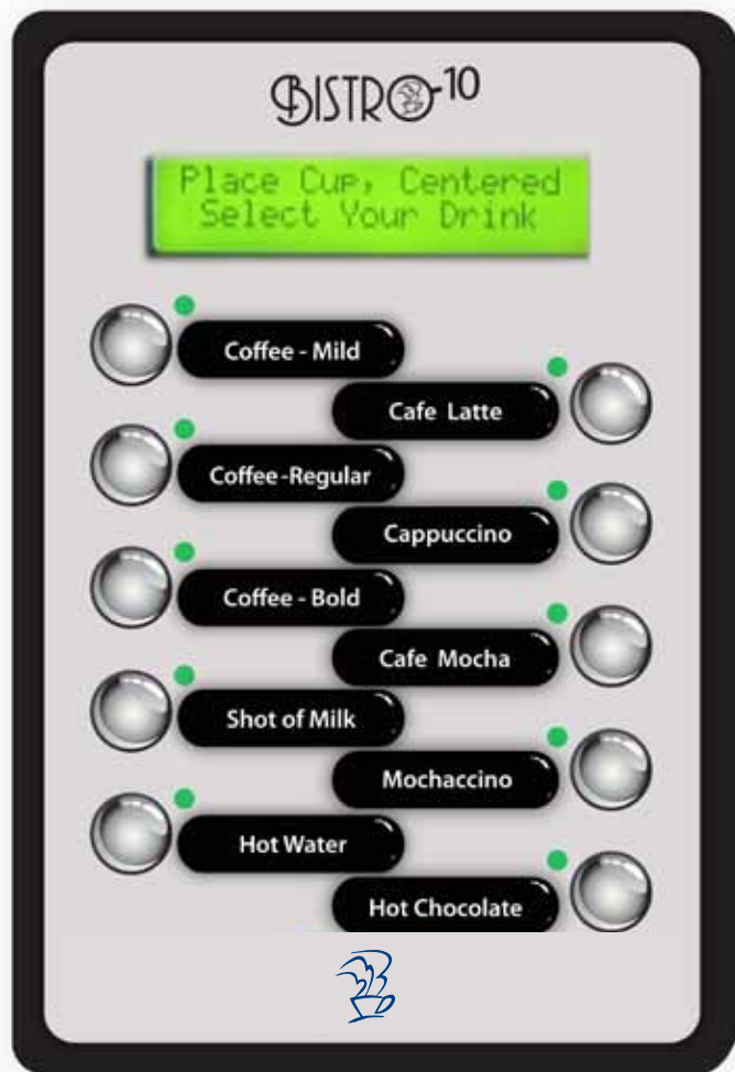
Close-up of membrane switch showing our standard drink options

Bistro 10 entire front can be custom branded with your image helping you to promote your brand and services.