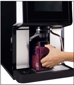
Easy to Maintain