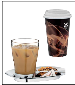
Huge Selection of Beverages