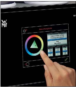
User Friendly Interface